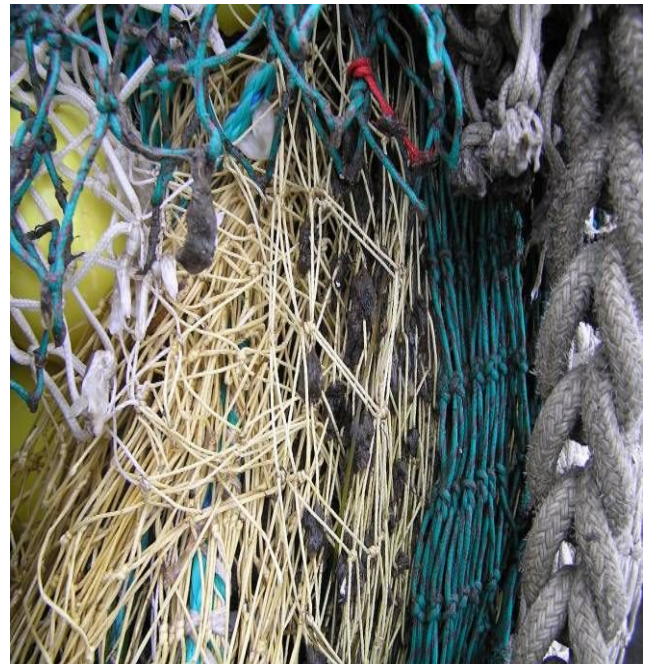
The dyneema netting with T90 masker

As it appears from the photo knotless netting have been used in the cod end to improve quality of the catch.