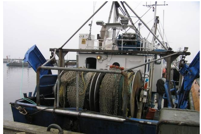
The pelagic doors on "Katrine Kim"

Before the project the vessel used traditional bottom trawl doors. These were replaced by a set of pelagic doors of 375 kg's from Thyboron Trawl Doors (Type 15 at 2 m 2 ).