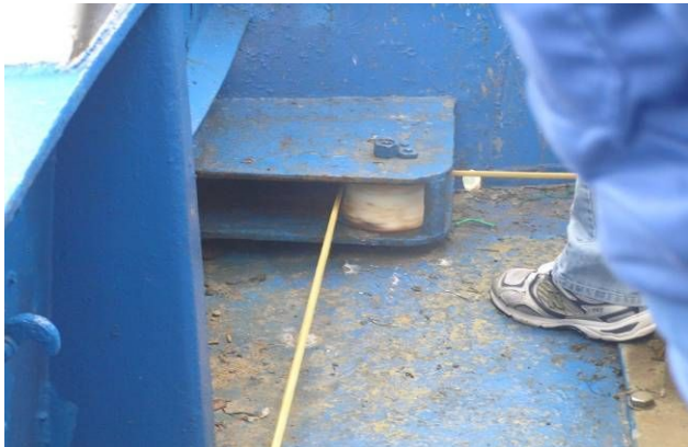
Nylonrollers for protection against wear

But the rope must be protected against wear. In the project this was done by replacing galvanized rollers by nylon rollers, but stainless steel can also be used.