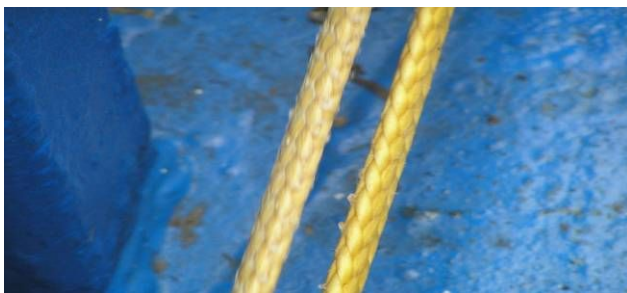
The Dyneema rope after one years service

It is expected that the economic lifetime of the rope will be minimum 5 years against 1 year for the conventional steel wire. The price is double that of the wire, but the annual costs are still less than half by using the rope.